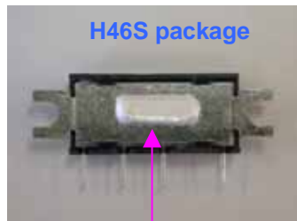
Thermal compound size: L10 x W3.0 x t 0.5mm