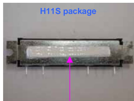
Thermal compound size: L40 x W5.0 x t 0.5mm